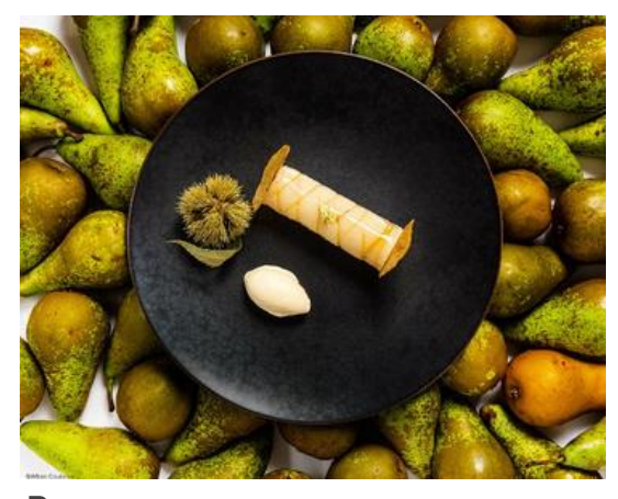
Pear textured Guyot, vanilla chestnut