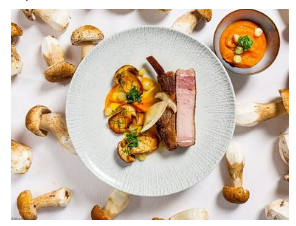
Iberian pork chop porcini mushrooms, pumpkin & patisson