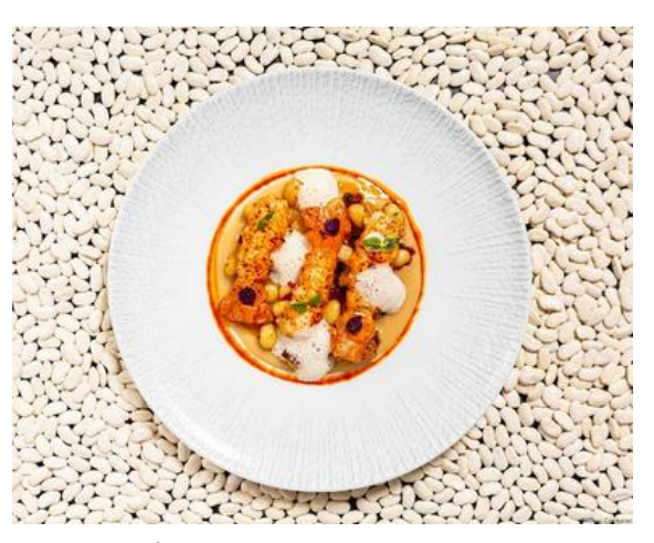
Langoustine Paimpol coco beans, piquillos & Espelette