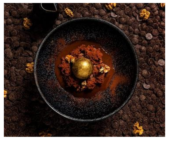
Chocolate iced sphere, & walnut kernels.