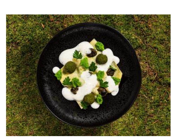
Snail with parsley butter, & ravioli with herbs