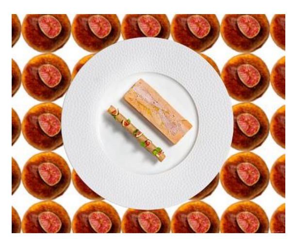
Foie gras & Solliès figs